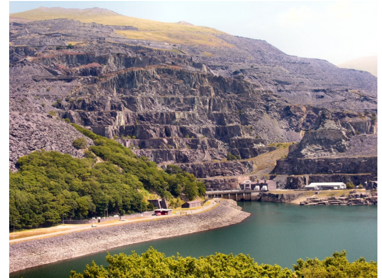
Figure 1. Part of the Dinorwig hydroelectric power station, a system that stores energy by pumping 6.7 million m 3 of water up around 500 metres and then releasing it to supply 9 GWh of energy at a rate of around 2 GW.

Level 4 assumes that by 2050 the UK has 20 GW of storage, with a storage capacity of 400 GWh, and 30 GW of interconnectors. This level also assumes that around 75% of electric cars allow flexible charging for co-ordinated demand shifting.